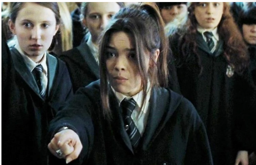
PANSY PARKINSON PLAYED BY SCARLETT BYRNE HARRY POTTER AND THE DEATHLY HALLOWS - PART 2 (WARNER BROS, 2011)

and you can follow her on Instagram and Twitter: @the45girl